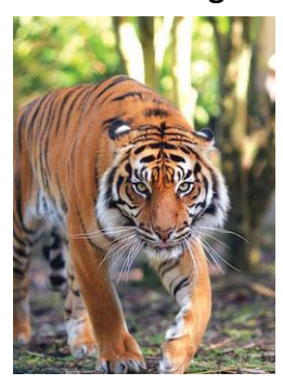
savannah rainforest wetlands