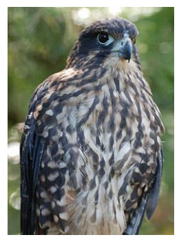
rainforest savannah bush