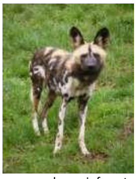
savannah rainforest bush