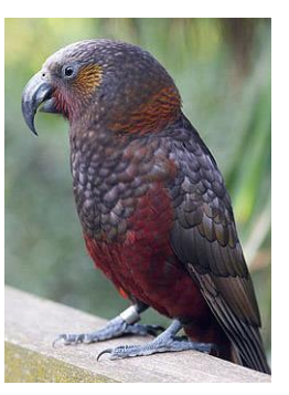
savannah bush ocean