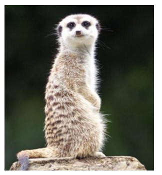
grasslands wetlands rainforest