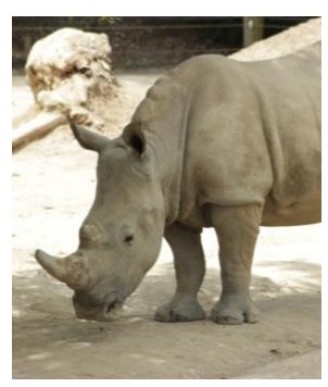
savannah rainforest desert