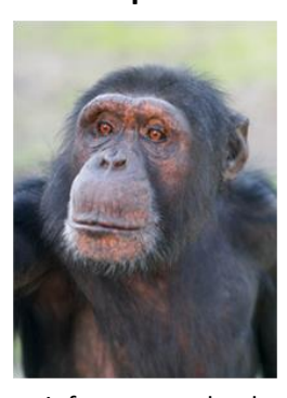
rainforest wetlands savannah