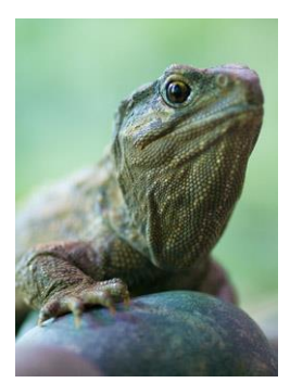
bush rainforest wetlands